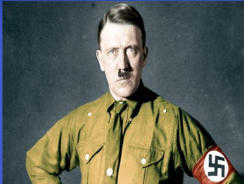
Adolf Hitler / Germany's Fuhrer