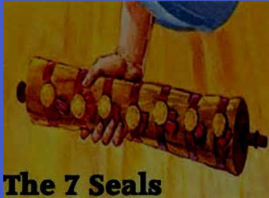
The 7 Seals

B. (5:1b) The SCROLL: Revealing future events.