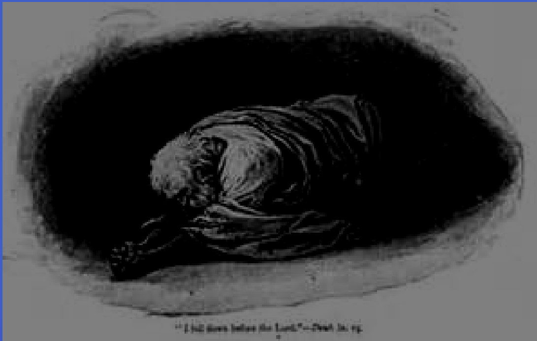
"I hid down before the Lord." - Psalm 142:7

D. (5:4-5) The SOBBING SEER : Over silence in heaven.