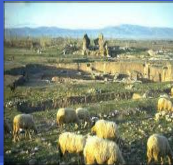
Ruins at the city of Philadelphia

This church's love for Christ was evident before everyone. Their faith in God's promise of eternal life was revealed by their actions in the midst of a tragedy. In spite of loosing everything in a terrible earthquake, they were willing to reach out and meet the needs of their brothers and sisters in Christ. By doing this the message of the Gospel was evidenced before all. As a result of their love they will be forever identified with Christ and cared for by the Father.