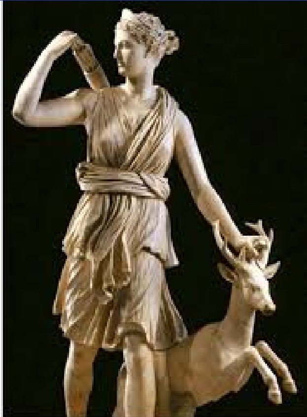
Artemis with young stag, known as Diana of Versailles , marble, 1st-2nd century AD